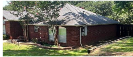
(2) FRONT RIGHT CORNER ELEV.