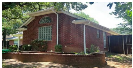
(6) REAR LEFT CORNER ELEV.