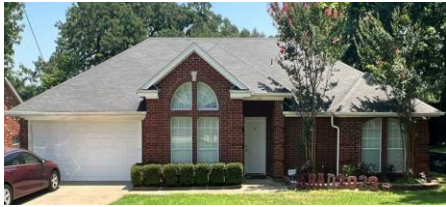
(1) FRONT ELEVATION

THESE (8) ELEVATION PHOTOS ARE REQUIRED TO COMPLETE HOVER REPORTS