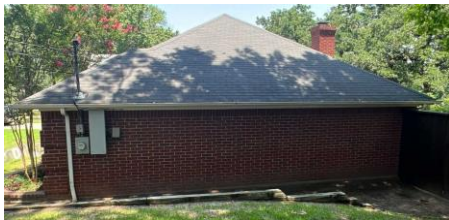
(3) RIGHT ELEVATION