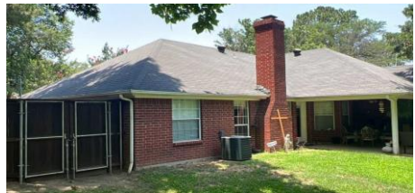
(4) REAR RIGHT CORNER ELEV.