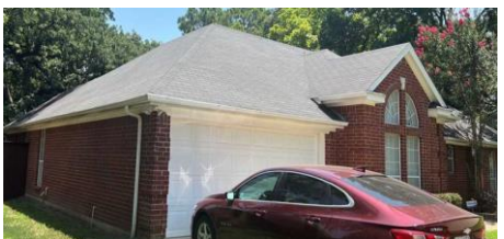
(8) LEFT FRONT CORNER ELEV.