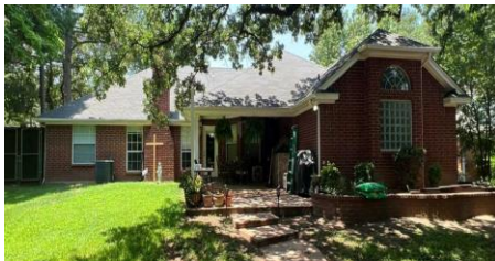
(5) REAR ELEVATION