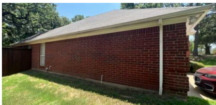
(7) LEFT ELEVATION